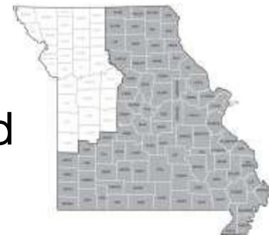
MFH Supported Service Area

Available to organizations outside MFH's service area or services that are not health and prevention focused.